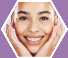
Wrinkles & Lines